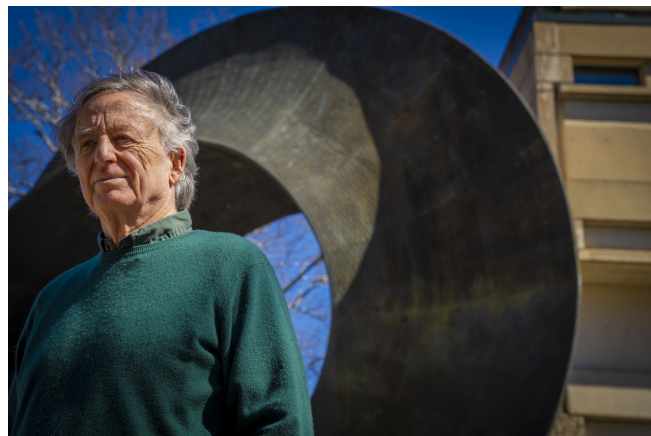
Dennis Parnell Sullivan – 2022 Abel Prize laureate.

I was walking in to take the exam, and thought: "Let me look at it one more time before the exam". I went to the library, opened the book, looked at it. It's a small book, it's got ten theorems in it. But still, there are a lot of steps, and I was looking at it one more time, and then this basic picture appeared to me: You have a map to something like a sphere, and you take the preimage of a point – which is what is called a nice value – you get a nice submanifold by the Implicit Function Theorem. You get local coordinates, and then the neighborhood sort of funnels down, like you would push a slinky down and flatten it out completely. But this was saying something about the global map: There is the preimage of one point, and then I noticed: "Oh, wait a minute, the preimage of one point has all the information." The complement may be very complicated in the domain, but the complement of a point or a disk in the image sphere is contractible. It's like taking a point out of a balloon, it contracts, it's contractible! So you can extend the mapping to the contractible part uniquely. Any choice you make will be related by deformation to any other choice.