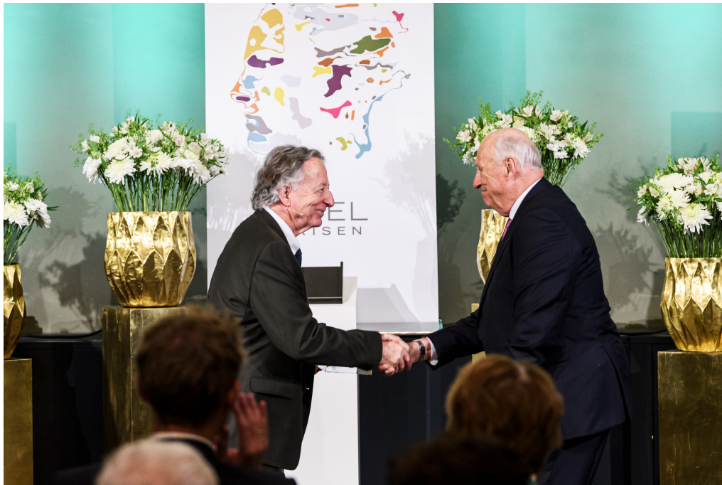
Abel Prize laureate Dennis Sullivan receives the Abel Prize from His Majesty, King Harald of Norway.

But the important distinction here is between what can be deformed and pushed, well, in homotopy theory, in the homotopy type – to use technical jargon – as opposed to the actual manifold?