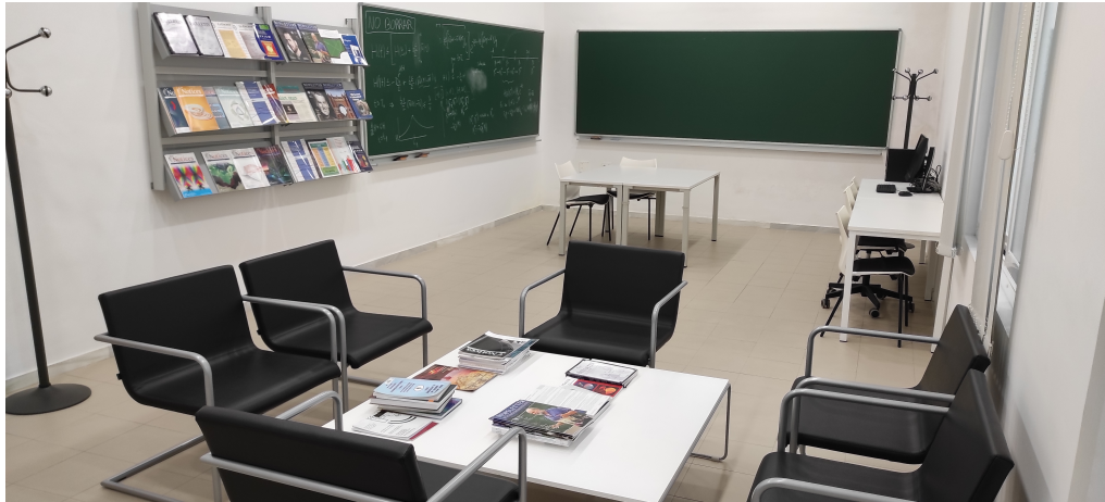
IMAG provides common areas for discussion and reading in a relaxed atmosphere, besides offices and seminar/conference rooms.