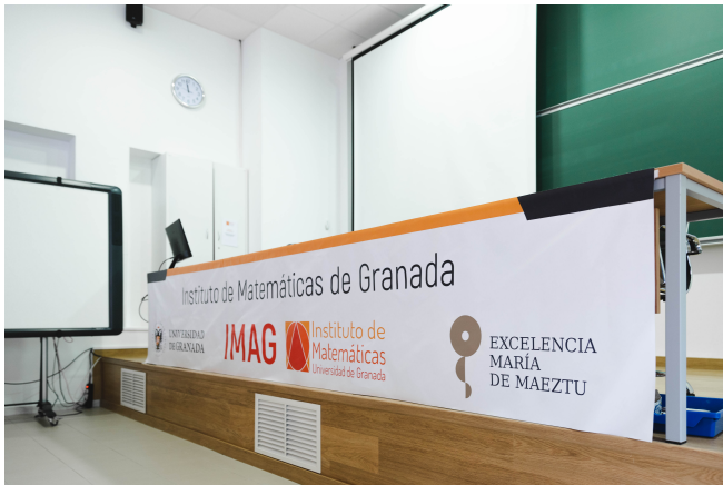
Conference room at IMAG

are covered by three copier-printers installed on network. Besides Ethernet connections in the offices, a wireless internet connection is available everywhere in the building. As part of the UGR research infrastructure, electronic access to databases and journals is also available.