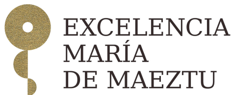
Logo of the Program of Excellence “María de Maeztu” by the Spanish Research Agency (AEI)

The excellent level of mathematical research at IMAG is supported by more than 25 research projects at international, national, and regional levels, awarded to members of the institute and currently in execution. As a consequence of its successful trajectory, starting in January 2022 IMAG enjoys a “María de Maeztu Excellence Unit” accreditation by the AEI, funded with almost two million euros for