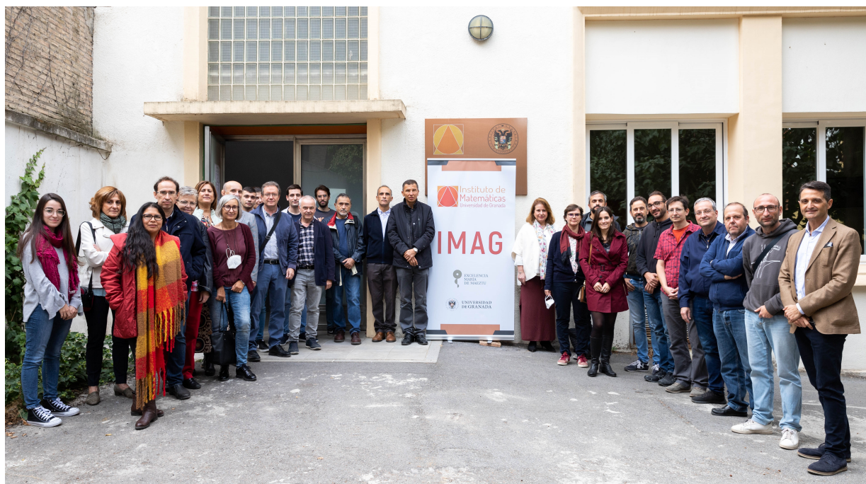
Interaction of researchers in different domains has proven essential for strengthening the scientific life at IMAG.

As part of the IMAG’s international strengthening policy, the institute has recently associated with the Banff International Research Station (BIRS, Canada) in hosting a series of research workshops that are part of the scientific program of BIRS. This is one of the key