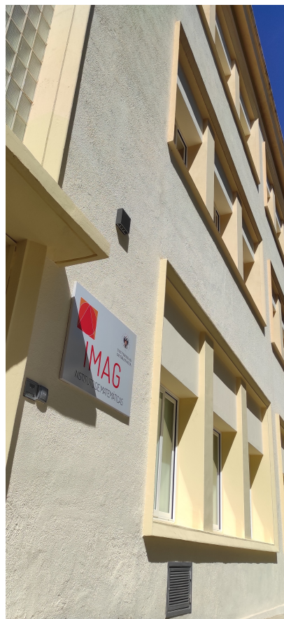
The institute building is located at the Campus Center, Rector López-Argüeta S/N.

IMAG facilities are located in a building donated by the Spanish National Research Council (CSIC), at approximately 500 meters from