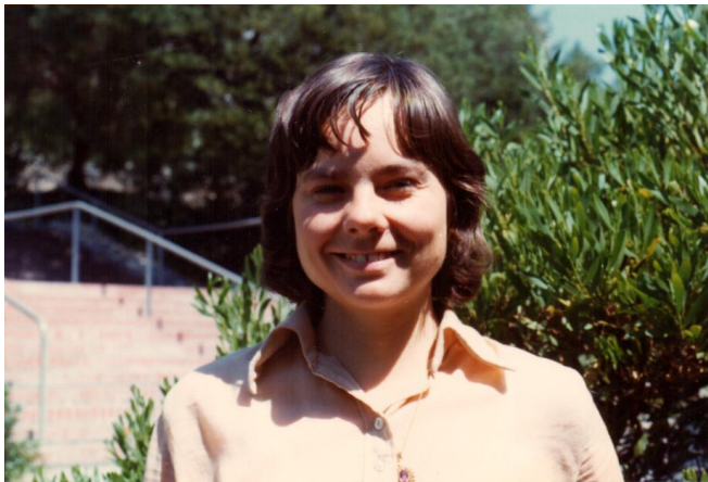
Berkeley campus 1977.