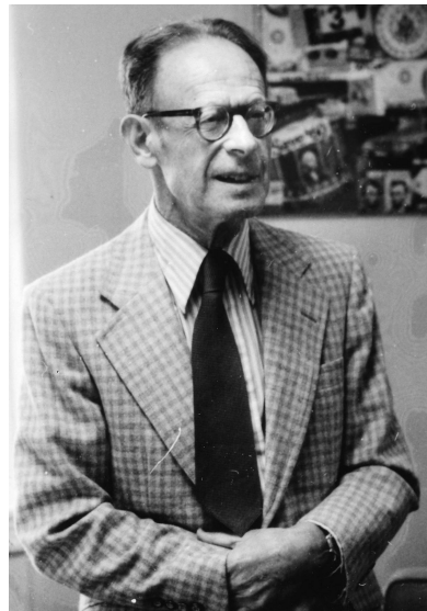
André Weil