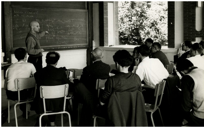
Alexander Grothendieck lecturing at the Séminaire de Géométrie Algébrique du Bois Marie at the IHÉS