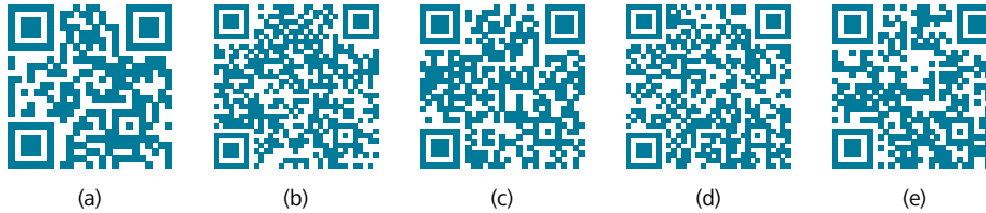
Table 1. Get in contact with the Juniors: visit our website (a), check out GAMMAS (b), join our discord server (c), visit and follow our LinkedIn account (d) and pay the SAMM homepage (e) a visit!

or join our discord server, 8 where we keep you informed and up to date with various developments within our community, providing a space for continuous learning and engagement. Also make sure to visit our pages, 9 see the QR codes in Table 1.