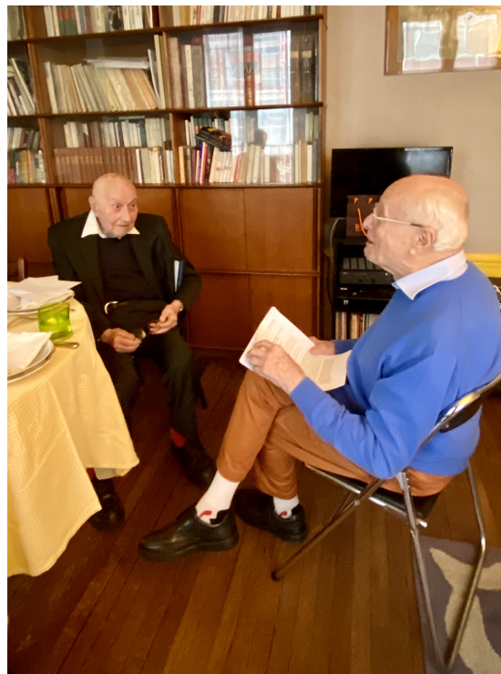
Jacques Dixmier and Jean-Pierre Serre before the dinner.

The most memorable moment of the dinner came at the end, after the cake. We had been waiting for the champagne, but it finally appeared, as if by magic, in another form at just the right moment: Jacques, on his feet, blossoming, launched into a carefully prepared speech, to say a few particularly relevant and kind words to each of the guests. He spoke without the slightest note or hesitation and began by recounting with humility and precision the milestones in his life as a mathematician. From his secondary studies, the entrance exam to the ENS, to his recent discoveries, he recalled each phase where, thinking at first that he would not succeed, he had been surprised to do better than he thought he could. The audience listened with rapt attention, eager to prolong the moment.