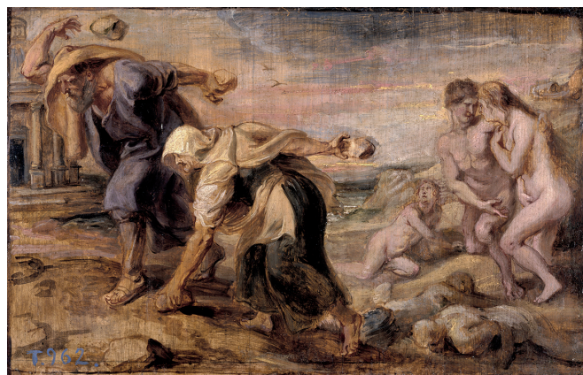
Deucalion and Pyrrha, Rubens (1636), Prado Museum.

Mathematical theorems, their proofs and ideas that give them life do not belong to anyone, not even their authors. Upon writing this, one can easily imagine the small smile appearing on the mouth of the reader, as if to betray the beginning of a small resistance to this statement. These somewhat exaggerated statements, however, are able to open the way to reflection. It is in the same way that from an indistinguishable block of stone, certain sculptors of Antiquity were able to carve beautiful and graceful figures rivalling nature. One has to mention the story of a certain Cypriot Pygmalion, who created such a lifelike sculpture and who loved it with such passion that Venus gave her life. 1 There are also many legends in which men assume the character of demiurges, 2 who give life to shapeless and inert objects. We remember, for example, the wise men Deucalion and Pyrrha, saved from the flood by Jupiter, who recreated humanity by throwing stones (probably clay stones) behind them. 3