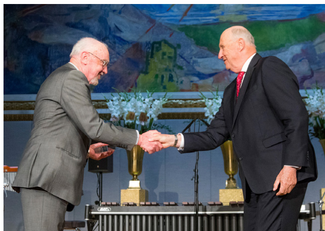
Robert Langlands receives the Abel Prize from H.M. King Harald.

Why did I start...? Here is my conjecture. There are two things (I will come back to the second thing in just a minute). I went to high school. There were children from the neighbourhood and from the surrounding countryside, and they tested us. I was indifferent, you know. I didn't pay too much attention but they also used IQ tests and my conjecture has always been that I probably had an unusually high IQ – quite an unusually high IQ – I don't know. It didn't mean much to me then but that is my conjecture in retrospect. Many of our teachers were just former members of the army in World War II, who were given positions as teachers more as a gratitude for their service in the army. This fellow – he was young, he probably had a university degree and he took an hour of class time to say that I absolutely must go to university. So, I noticed that.