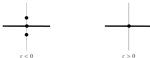
Fig. 3. Spectrum of L_\varepsilon .

The aim of the present paper is to prove the existence of a family of bifurcating periodic solutions of (2). The bifurcation of periodic solutions might be studied for \varepsilon < 0 in using the way of [6] which generalizes the Lyapunov–Devaney method for finite dimensional reversible vector fields. However, there is an additional technical difficulty due to the fact that the two imaginary eigenvalues are close to 0 together with the occurrence of 0 in the continuous spectrum as in [6]. Notice that the periodic waves obtained in [7] are of the same nature as in [6]. On the contrary, the solutions which interest us below are the bifurcating periodic solutions for \varepsilon > 0 . These ones are of different nature, and similar to the ones observed in the case of a three-dimensional one parameter family of reversible vector fields where 0 is a fixed point and where in addition to the 0 fixed eigenvalue of the linearized operator, a pair of