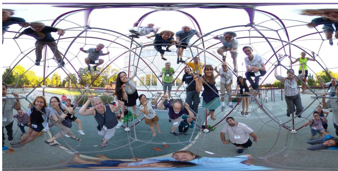
Figure 1. Bridges participants on the polyhedral climbing structure in the Mathematical Garden of the Tekniska Museet in Stockholm, Sweden (Equirectangular projection of spherical photograph by Henry Segerman)

Videos from the annual Bridges Short Film Festival are also posted at gallery.bridgesmathart.org/exhibitions . The creative diversity of the eight 2020 contributions is impressive. For example, Spatial Variants of a Propeller , by the Kocaeli Team, shows the filmmakers' inspiration for and development of a kinetic sculpture based on an iconic propeller displayed in Kocaeli, Turkey. George Hart's Warped-Grid Jigsaw Puzzles shows how to design complex puzzles using algorithms and transformations. The results are stunning works of art that can be assembled over and over. The Arts of the Finite Topology Conjecture , by Katrin Leschke, Chloe Ali-gianni, Lee Boyd Allatson, Jenny Hibberd, and Andrew Johnston, explores a collaboration between a mathematician, two musicians and a dancer and their interpretations of this conjecture. It is just a taste of what was clearly an exciting and rich experiment and is a great example for mathematicians and artists interested in such partnerships.