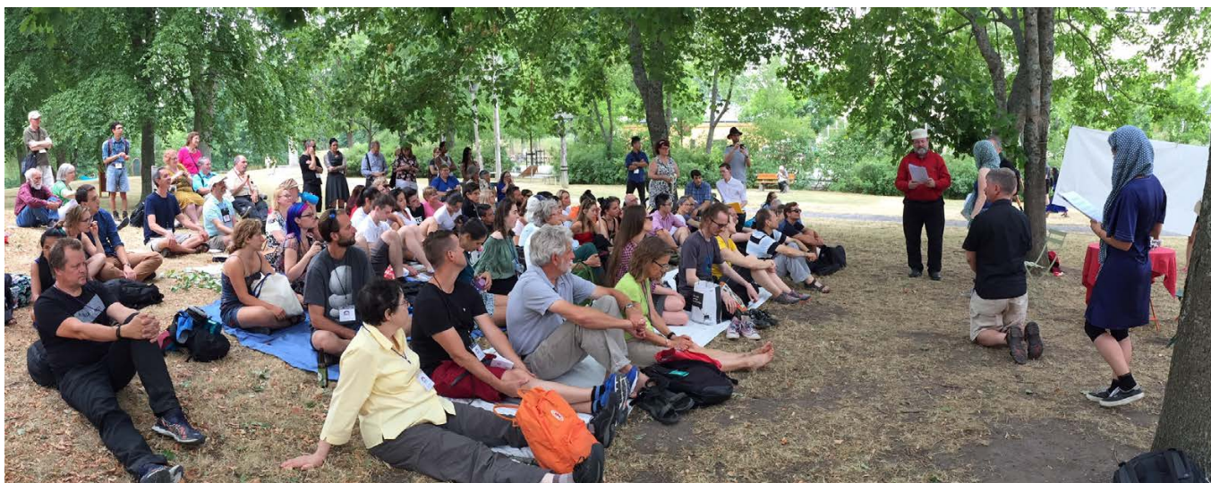
Figure 3. An audience enjoys the outdoor debut of "Witches of Agnesi" at the 2018 Bridges conference