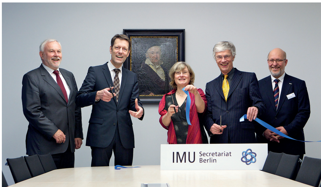
IMU President Ingrid Daubechies inaugurates the IMU Secretariat in Berlin in January 2011

optimal distribution and storage will be one of the future target areas of WIAS. This is also true for the extraction of information from data of various kinds and the incorporation of data-driven models into its research workflow, as well as for challenges in quantitative biomedicine, in particular medical imaging. In the field of “Material, Light and Devices”, research on quantum-technological aspects will be pursued.