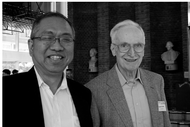
Eugenio Calabi with Shing-Tung Yau at École Polytechnique in 2007