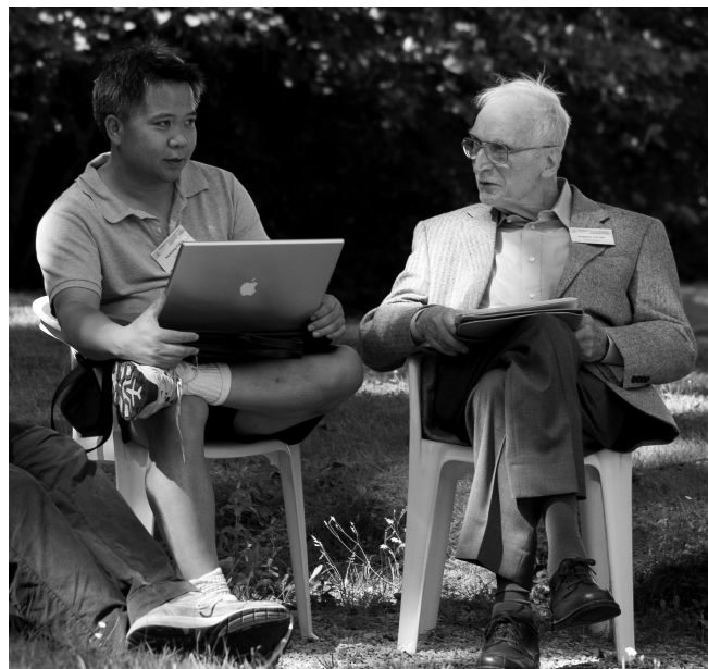
Eugenio Calabi with Xiuxiong Chen at IHÉS, 2007

A second example is his discovery, more or less at the same time, of the grim reaper for the curve shortening flow of closed curves on the plane, again over tea at Penn (it is not well known that he discovered, and named, this example). It is the unique simple ancient solution of the flow, foreshadowing that this is a crucial property for the flow, only understood much later. His influence on me and many others was through mathematical conversations, with observations that often became crucial in later developments. His love for mathematics (but not for writing papers) was obvious to everyone. Happy Birthday Gene!