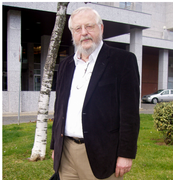
F. William Lawvere, Braga, March 2007