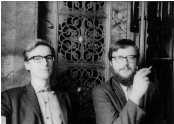
F. W. Lawvere with the author at Cafe Odeon, Zürich, Fall of 1966

The basis for this axiomatic science of cohesion is a string of four functors