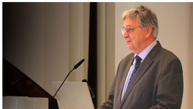
László Lovász in Leipzig, in November 2022.

LL: Well, it started a little earlier, maybe in the 8th grade, when I joined the math club of my elementary school. I really enjoyed working on the problems that were posed there, and the teacher of the math club, who was also the director of the elementary school, recommended us to subscribe to a Hungarian journal of mathematics for high school students. The journal was established in 1893, and I think it's the oldest one in the world which is still functioning. And that was a great experience! Paul Erdős used to write for the journal as well. He liked to pose some open problems that were easy to formulate but difficult to solve, and he always