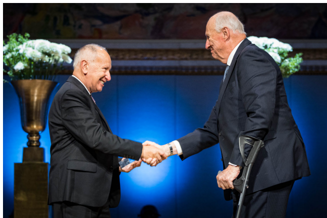
His Majesty King Harald V presents the 2023 Abel Prize to Luis Caffarelli.

properties, i.e., high order differentiability. The Monge–Ampère equation is a fully nonlinear PDE that frequently arises in differential geometry; for example, it is used to construct surfaces of prescribed Gaussian curvature. How did you get started to work on the Monge–Ampère equation and, more generally, on fully nonlinear equations?