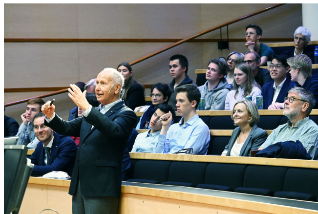
Abel laureate Luis Caffarelli giving his lecture at the University of Oslo, 2023.