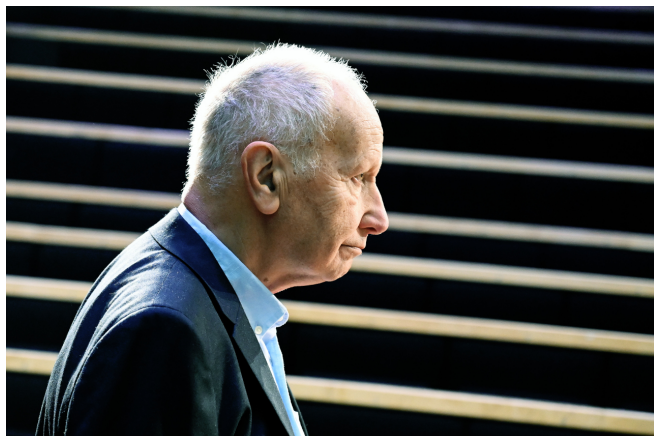
Luis Caffarelli Abel Prize laureate 2023.