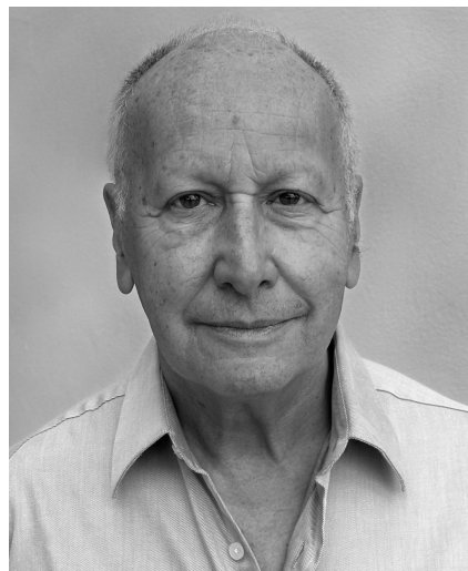
Luis Caffarelli, Abel Prize laureate 2023.

LÁC: I like to cook, but my wife is a better chef than I am. I also like to play some soccer if I have time. I play the piano. I prefer mostly classical music.