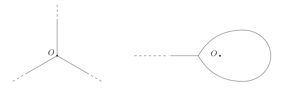
Figure 2. A standard triod and a Brakke spoon.