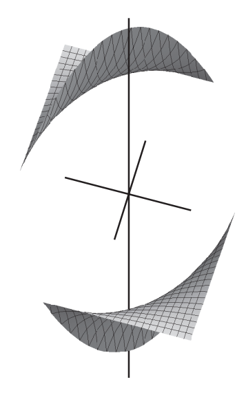
Fig. 2 A \sqrt{3} \times \sqrt{3} square of the Euler surface, centered at the origin.

real constant. One of the classical results in affine differential geometry states that any asymptotic curve on a Tzitzeica surface is a Tzitzeica curve.