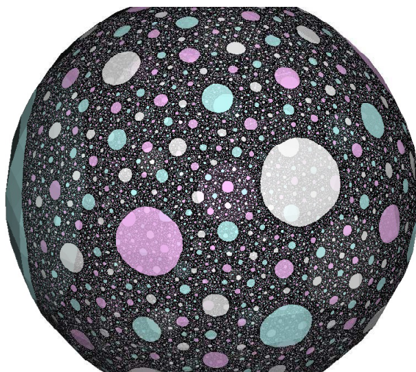
FIGURE 1. Julia set of Cui's map