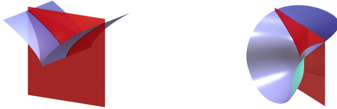
FIGURE 1. D = \{x(y^2 - z^3) = 0\} (left) is splayed and D' = \{x(x + y^2 - z^3) = 0\} (right) is not splayed.

D = D_1 \cup D_2 their union. Then D is called a splayed divisor if D_1 and D_2 are splayed at any point of their intersection. For an example of a splayed divisor D in a three-dimensional S , see fig. 1.