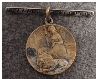
Pin from the 1928 Bologna ICM.