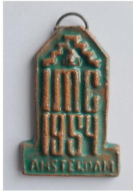
Poster and pendant from the 1954 Amsterdam ICM.