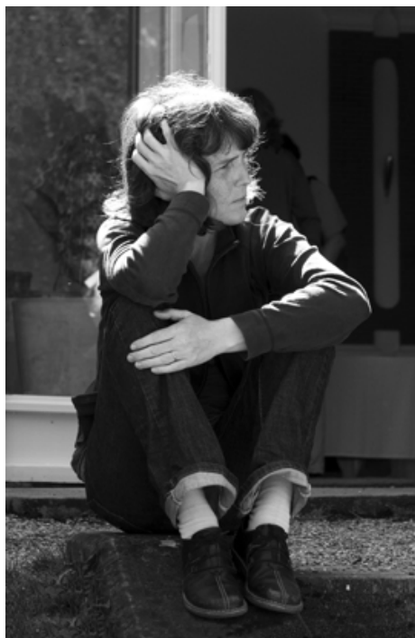
At the IHÉS in 2007.

In the past, with my children, we used to do lots of things, modeling... None of them were very talented. Correction, two of them were. Those were very nice moments! I also enjoyed educating and making activities, but not for playing pretend.