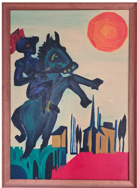
A painting painted by herself.

I don't understand why I am and he is not. There may be a number of political reasons why he isn't, and I got the title just because I am a woman. Nowadays, it is fine to give these titles to women. I don't like this situation and I consider it very unfair.