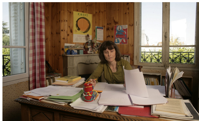
Claire Voisin in her home-office in 2004.

Claire Voisin approached and solved problems with a long history. Her name is undoubtedly connected with famous conjectures such as Kodaira's conjecture, Hodge's conjecture, Green's conjecture and mirror symmetry. She was awarded several prizes among which we highlight the Shaw Prize (2017), known as the eastern Nobel Prize. We also highlight, among others, the European Mathematical Society Prize (1992), the Servant prize of the Académie des Sciences (1996), the Ruth Lyttle Satter Prize in mathematics (2007), the Clay Research Award (2008), the CNRS Gold Medal (2016), and, more recently, the L'Oréal-UNESCO Women in Science Award (2019). She was an invited speaker at the International Congress of Mathematicians (ICM) in 1994. In recognition of her contribution to science, she is a member of several scientific societies, including the Académie des Sciences, the German National Academy of Sciences Leopoldina, the Royal Society of London, the National Academy of Sciences (US) and the American Academy of Arts and Sciences.