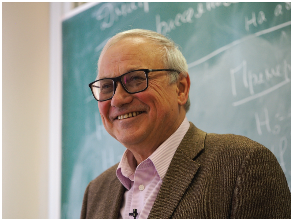
Figure 1. Dima Yafaev (St. Petersburg, 2018).

On 16 June 2024, Dmitri Rauelevich (Dima) Yafaev, an outstanding Soviet, Russian, and French mathematician, specialist in mathematical physics, functional analysis, and spectral theory of operators, a member of the editorial board of JST, passed away.