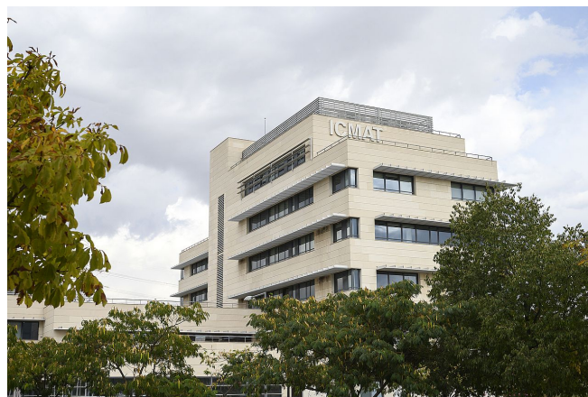
Figure 1. ICMAT is located on the UAM+CSIC Campus of International Excellence in Madrid.

ICMAT's development has been supported to a significant extent by the Severo Ochoa and María de Maeztu Programme for