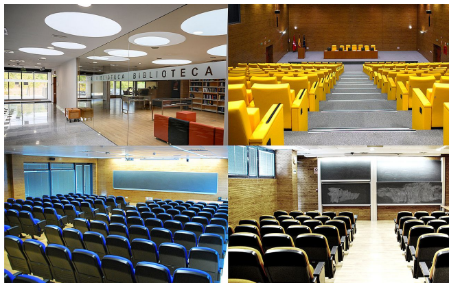
Figure 2. The ICMAT facilities make it possible to host an intense program of scientific activities.

and 5 management staff. By 2022, these numbers had risen to 65 faculty, 50 postdoctoral researchers, 45 graduate students and 11 management staff.