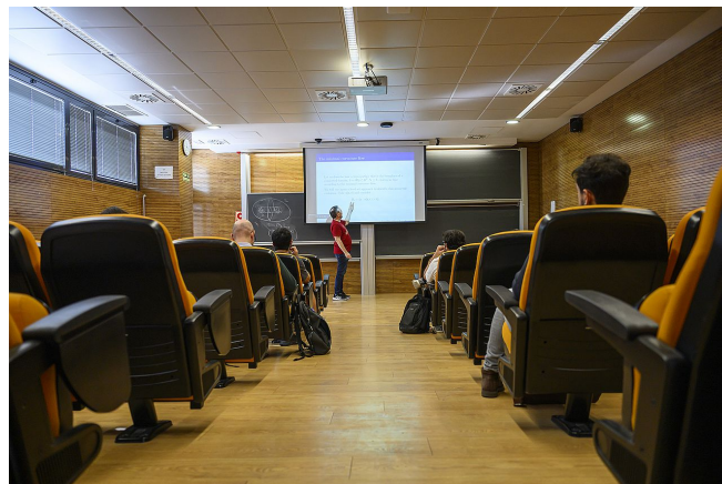
Figure 3. A large part of the centre's activity is funded by the Severo Ochoa programme of the Ministry of Science, Innovation and Universities.

Moreover, the institute further benefits from an excellent management team consisting of 11 people, working in areas such as IT services, project and grant management, outreach and communications, travel administration and the organisation of scientific events, providing essential support for the effective operation of the centre. This team has been created thanks to the Severo Ochoa