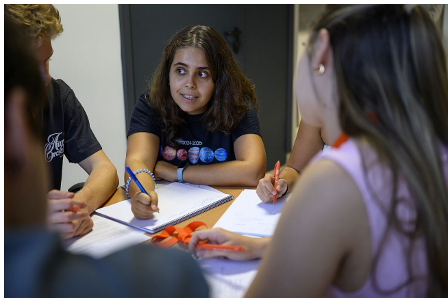
Figure 5. ICMAT is committed to fostering interest in mathematics among students at different educational levels.

students) a one-month training placement supervised by an ICMAT researcher, introducing them to the institute's research lines and scientific activity.