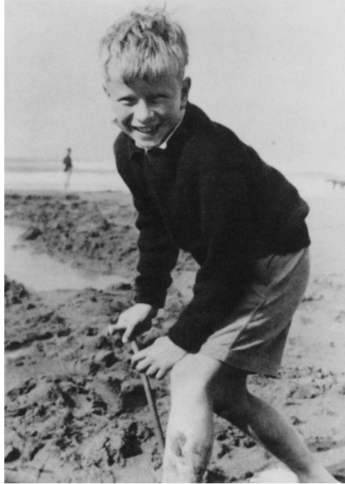
Fig. 3 Andrew Wiles in his childhood

Number theory and geometry, in particular diophantine equations and geometry, have been associated for about two millennia. In fact, it has been argued that the methods of Diophantus (ca. 250 AD) for the solution of diophantine equations could be viewed as geometric; these came to be known as the “tangent and secant methods” [4].