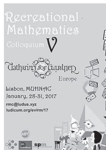
Poster of the Recreational Mathematics Colloquium V.

AL takes recreational mathematics very seriously. We honour Martin Gardner every year around 21 October, being part of the global Celebration of Mind event. 6 On odd numbered years, we organise the Recreational Mathematics Colloquia – Gathering for Gardner, Europe. 7 Of course, on even numbered years, the leading event happens in Atlanta, USA.