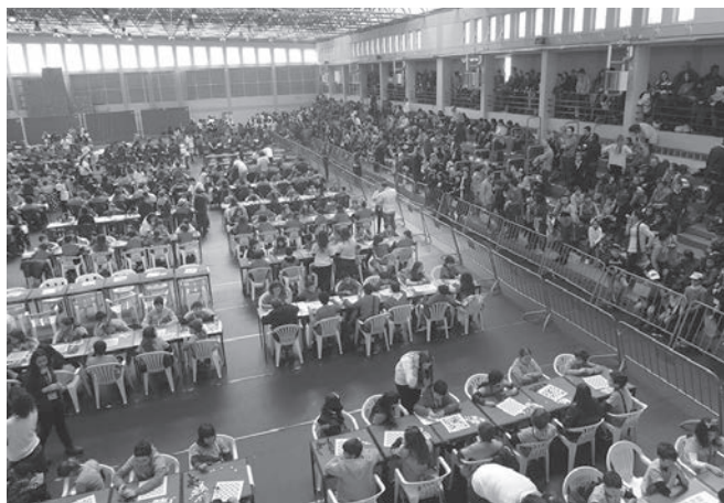
Final of the 11th National Championship of Mathematical Games, Vila Real, 6 March 2015.

Along one of the avenues leading to Jardim Botânico, several tables were prepared for games. Besides the Rubik's cube and origami, one could find traditional games, such as Mahjong, but the boards were mainly intended for abstract (i.e. mathematical) games. Visitors could play Hex, Amazons, Dots & Boxes, Traffic Lights, etc. These, among others, can be found at the National Championship of Mathematical Games, 2 a competition that has been attracting over 100,000 young people each year since 2004. In these games, luck plays no part. To beat the opponent, a player must be better at thinking with rigour and creativity.