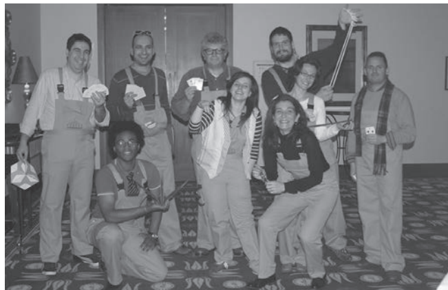
An early team of the Mathematical Circus.