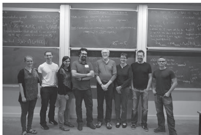
Speakers at the Research School, Belfast, September 2016.