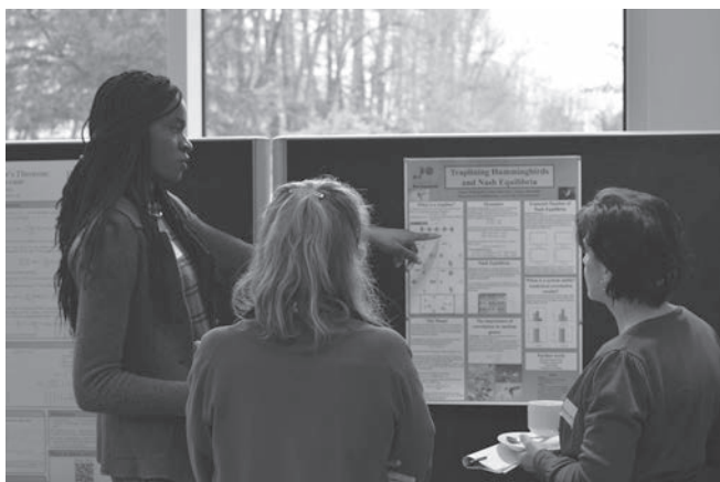
Participants at the LMS Women in Mathematics Day, Edinburgh, April 2016.