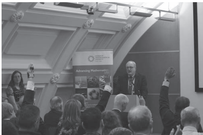
LMS Members at the Annual General Meeting, London, November 2016.