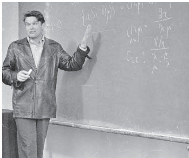
First Conference on Quantum Solitons. Leningrad, October 1978.

The next big subject Faddeev chose was the quantum three-body problem. At the time, he was already heavily attracted to the intricate and complicated problems of quantum field theory but believed that, before launching into the insecure waters of QFT, it was important to resolve a really difficult technical problem. While the difficulties of the quantum three-body problem are of an