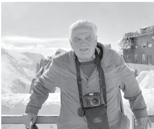
An excursion to the French Alps. Aiguille du Midi, March 2015.

the algebraic and analytic technique used to solve the spectral problem for quantum Hamiltonians. In its simplest version, this was the algebraic Bethe ansatz invented by Faddeev, together with Sklyanin and Takhtajan; it was followed by the more elaborate techniques of the functional Bethe ansatz and quantum separation of variables, introduced by Sklyanin a few years later. Active work in this direction is still going on up to the present day.