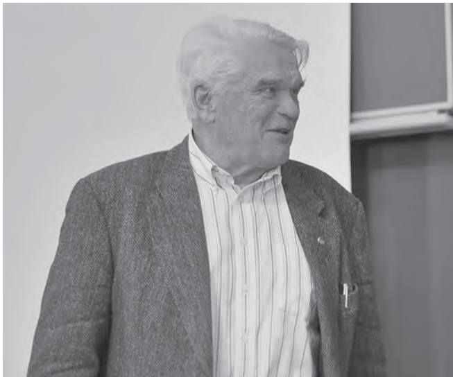
During the conference “Mathematical Physics. Its Past, Present and Future”. Euler Mathematical Institute, St. Petersburg, March 2014.